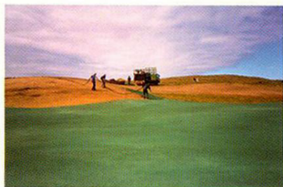
► Hydromulching of greens at Cape Schanck-Victoria